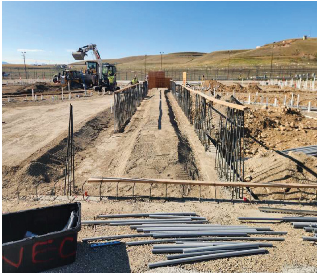
Construction, Page 9