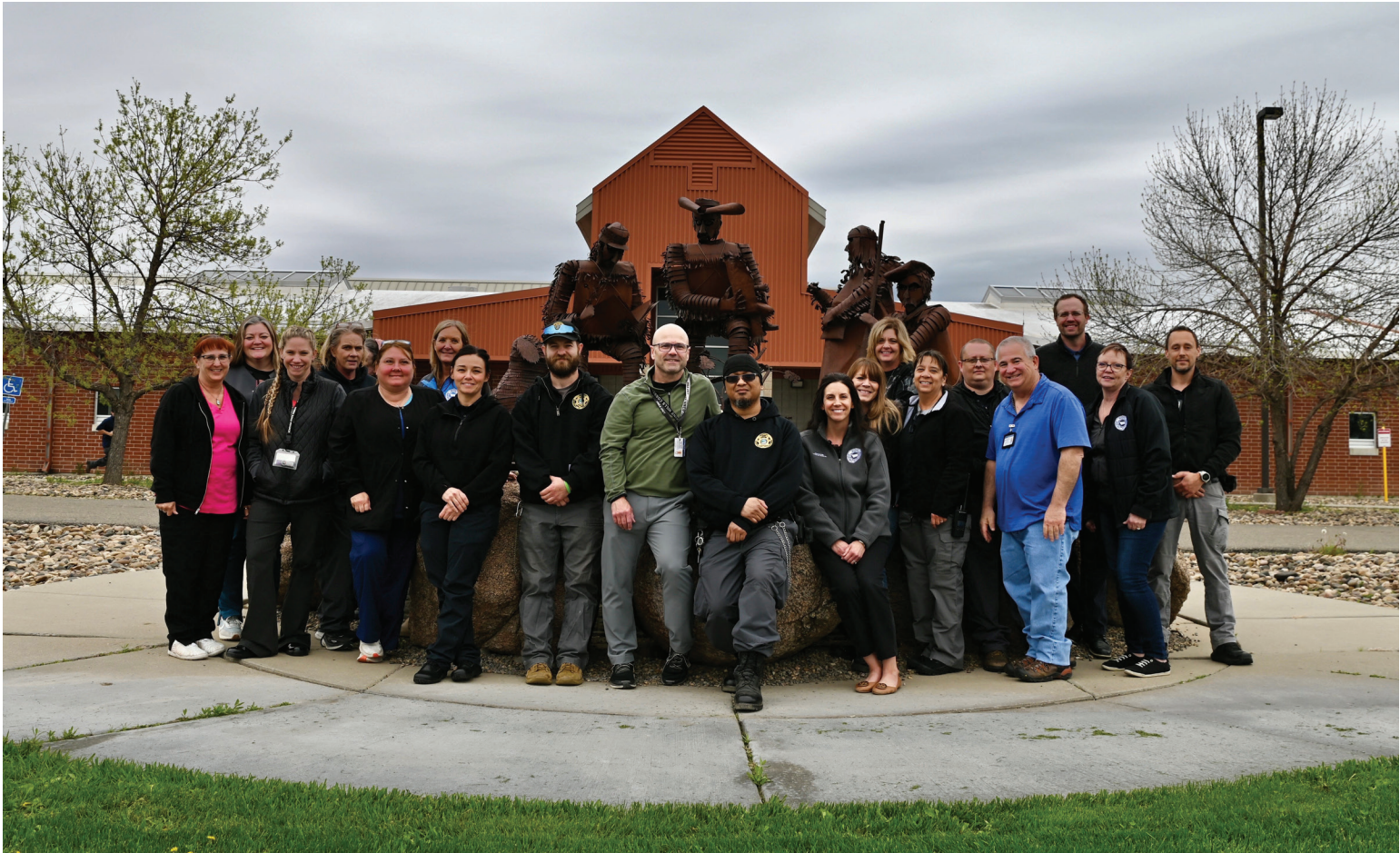
Pine Hills Correctional Facility staff members posed for a photo in recognition of their Barbara Allen-Hagen Award from the Center for Improving Youth Justice.