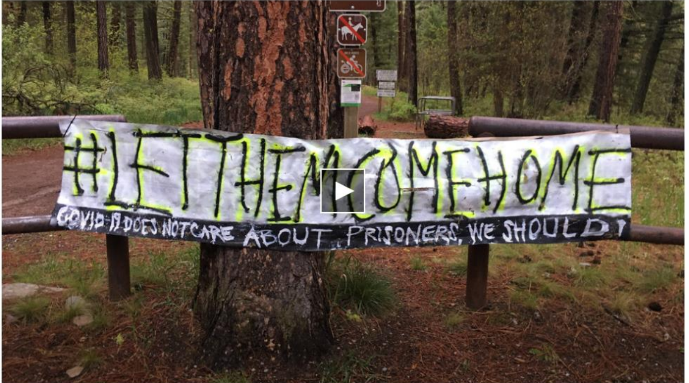
People are using "#LetThemComeHome" to bring awareness to what inmates are going through during the pandemic.

MISSOULA, Mont. — Signs reading “#LetThemComeHome” are being posted around Missoula in hopes of helping those inside Montana’s prisons.