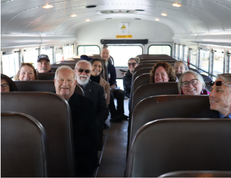
Members of the Interim Education Committee get ready to begin their tour of MSP and MCE.