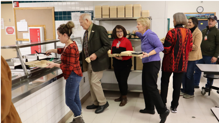
Legislators end their visit with a stop at the "chow hall" at MCE's Work and Reentry Center.